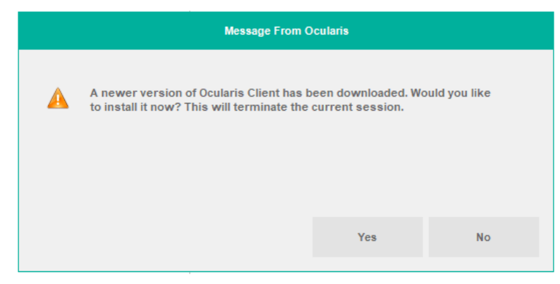
Figure 4 Upgrade Downloaded Message

Click No to avoid software installation at this time. The software may be manually installed at a later time by launching Ocularis Client x64.exe from c:\Program Data\OnSSI\OcularisClient.