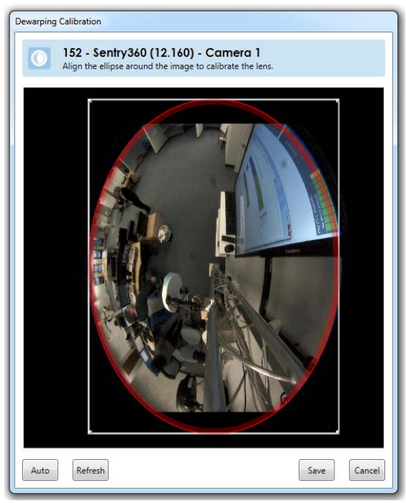
Figure 2 Sentry360